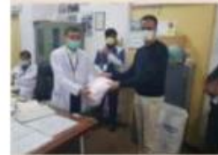
In Collaboration with OSIN Transportation Facility and PPE distributed