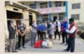
Fanchhar, Sansharan Nagar